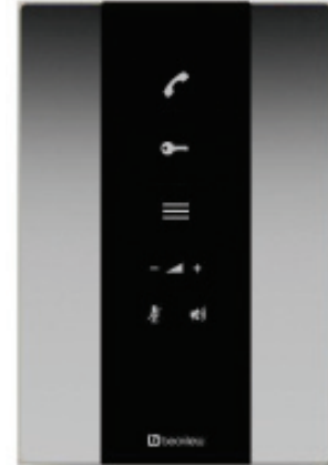
Dimensions: 95 (W) 140 (H) 14 (D) mm

The high fidelity FULL duplex audio communication makes this product exclusive.